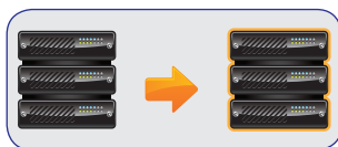
1. Create ShadowProtect backup image of an Exchange server