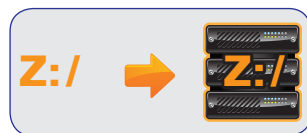
2. Assign a drive letter to ShadowProtect backup image